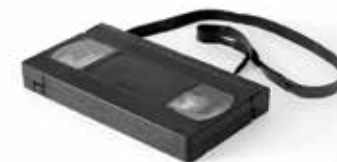
Photo slideshows Audio tape to CD/MP3 DVD to MP4